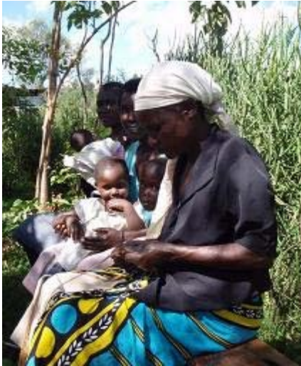
(women and children of the ONACAR Women Group)

trade market to their benefit, to become more autonomous and make a better future for their children. If you wish to donate directly to the Ajiri Foundation, visit their website